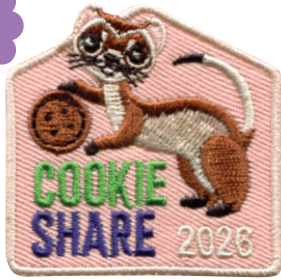
Cookie Share Patch