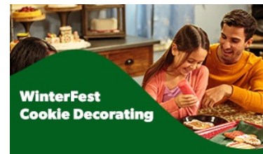
WinterFest Cookie Decorating

All Adults including Girl Scout troop leaders & non Girl Scout family members.