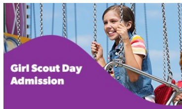
Girl Scout Day Admission