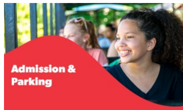
Admission & Parking

Choose this option to purchase tickets for Girl Scouts (girl members only) who are not season pass holders.