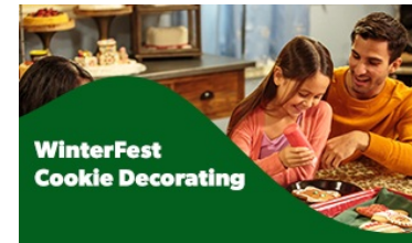
WinterFest Cookie Decorating