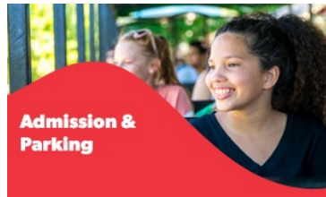
Admission & Parking