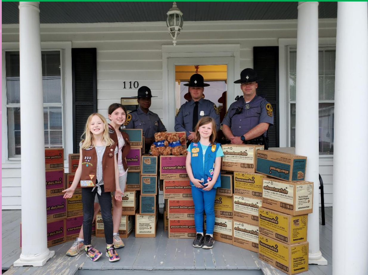
Girl Scout Troop 233 was proud to deliver a cookie donation to the Virginia State