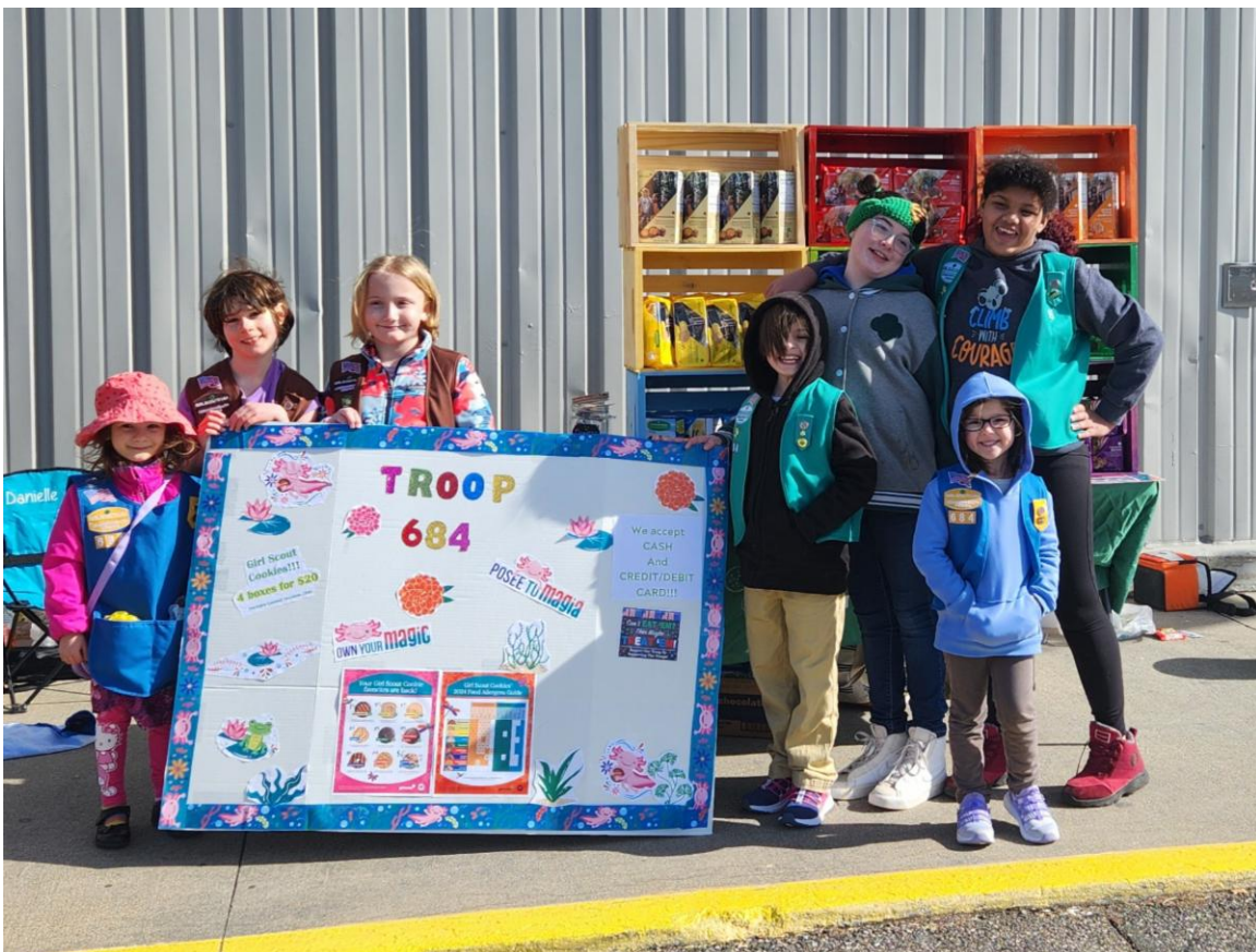
Vote for Girl Scout Troop 684's Axolotl-Themed Cookie Booth