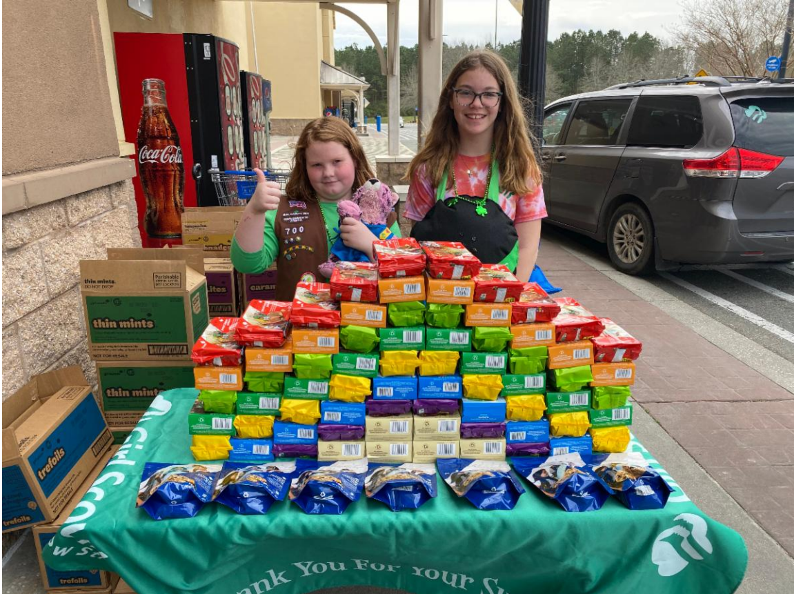
Taste the Rainbow with Troop 700's rainbow-themed booth!